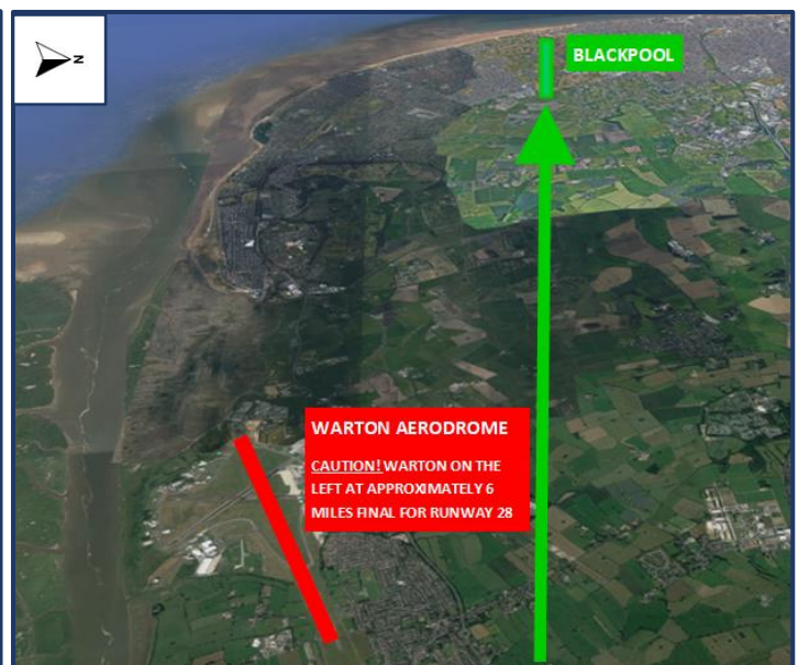
Figures 3 & 4 – Google images looking WEST – depicting Warton on the left when on the Runway 28 Approach.