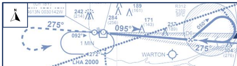
Figure 2 - Extract from ILS/DME Runway 28 chart