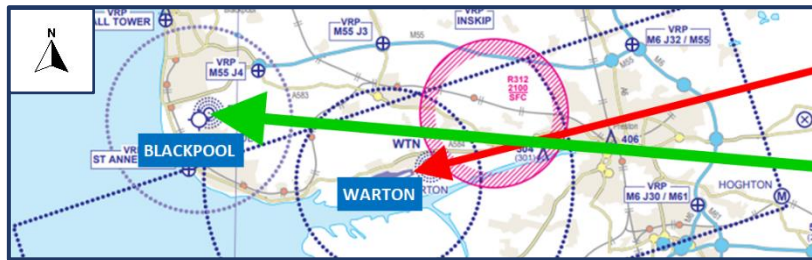
Figure 1- Image depicting relative positions of Warton & Blackpool